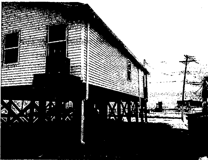
Left Side 1/27/16