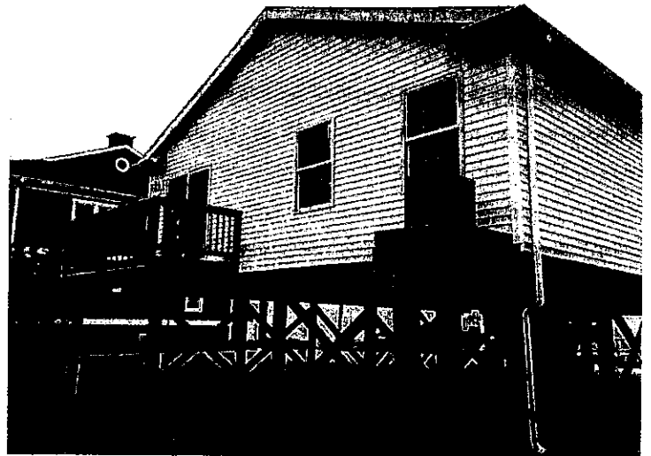
Rear View 1/27/16