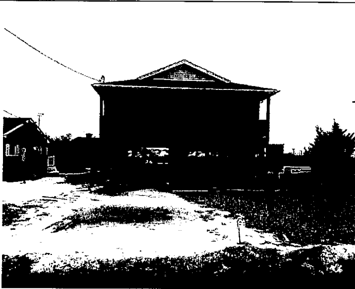
Front View 1/27/16

If using the Elevation Certificate to obtain NFIP flood insurance, affix at least 2 building photographs below according to the instructions for Item A6. Identify all photographs with date taken; "Front View" and "Rear View"; and, if required, "Right Side View" and "Left Side View." When applicable, photographs must show the foundation with representative examples of the flood openings or vents, as indicated in Section A8. If submitting more photographs than will fit on this page, use the Continuation Page.